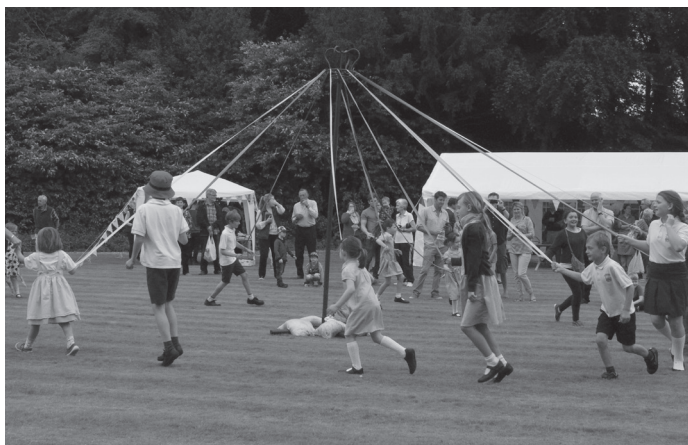
The school maypole dance