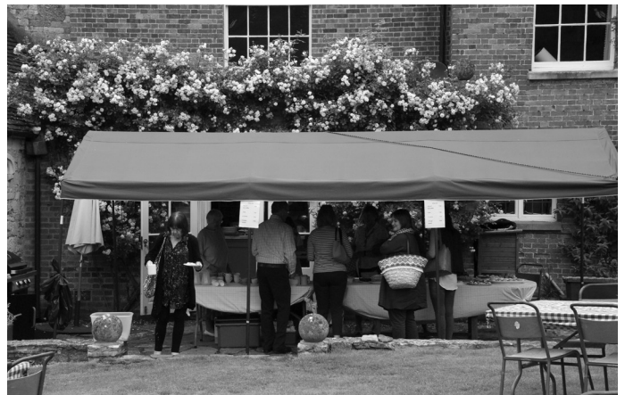
Tea and cake anyone?