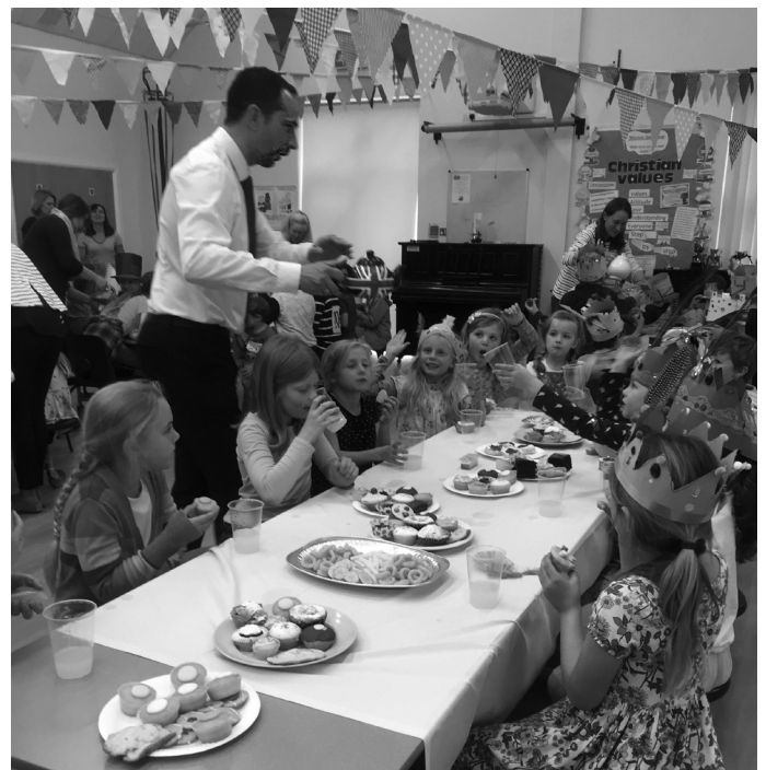
Queen's Birthday Tea